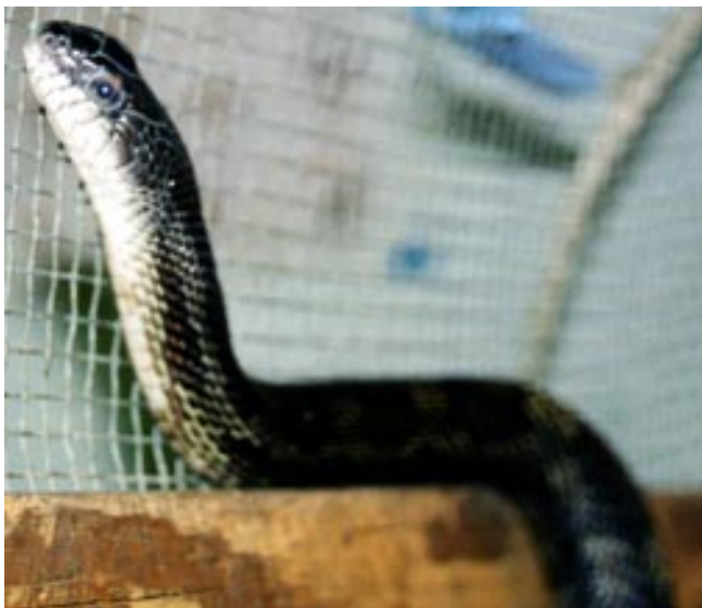
Jeeves, Black Rat Snake: Jeeves was admitted to the Center in July 2004 with an eye abscess and numerous wounds. It's assumed that he was attacked by crows. He's still undergoing treatment for his eye, but has his vision. Because of his injuries, he cannot be released.

The ARL Wildlife Center is a clinic for the rehabilitation of injured and orphaned wildlife. The Educational Programs provided to regional residents help to foster an appreciation for conservation and a harmonious existence between individuals and wildlife.